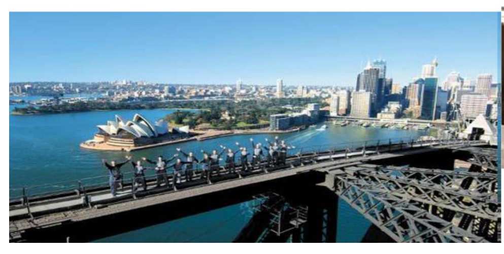
Day 06 SYDNEY DEPARTURE (BKF) After breakfast, check out formalities and transfer to Sydney International Airport for your flight departure.

After breakfast, proceed to Fish Market, choose your favourite fresh or cooked seafood at your own expenses. Then continue to visit and experience up close encounter wildlife in the Koala Park Sanctuary view up close on the Sheep Shearing Show, koalas, Kangaroos, Wombats and many more. Then continue journey to Katoomba region and visit the beautiful forest valley of Blue Mountain to view the 3 Sisters Rock between Jamieson and Burragorang valley from Echo Point and proceed to scenic station for 2 rides of the Scenic Railway and Cableway. On return journey back to Sydney city via en-route to view Sydney 2000 Olympic Stadium