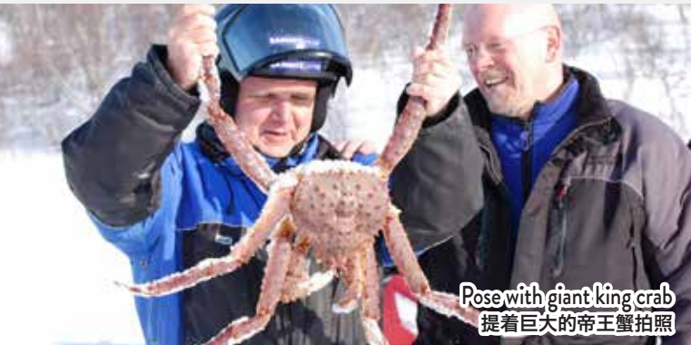
Pose with giant king crab 提着巨大的帝王蟹拍照